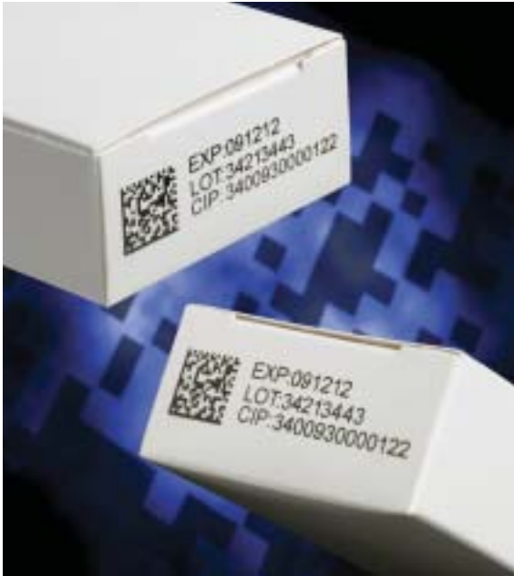
Example of CIP 13 compliant code printed by thermal ink jet

Domino, through its nominated representative is the only coding and marking company represented on the European Healthcare Initiative (EHI). Domino also advises BGMA (British Generic Manufacturers Association) and ABPI (Association of British Pharmaceutical Industries - Coding and Patient Safety Group). In addition, Domino has representations on all EPC global/GS1 bodies (The authority on global cross sector supply chain standards).