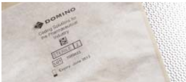
Example of Domino Thermal Transfer Coding