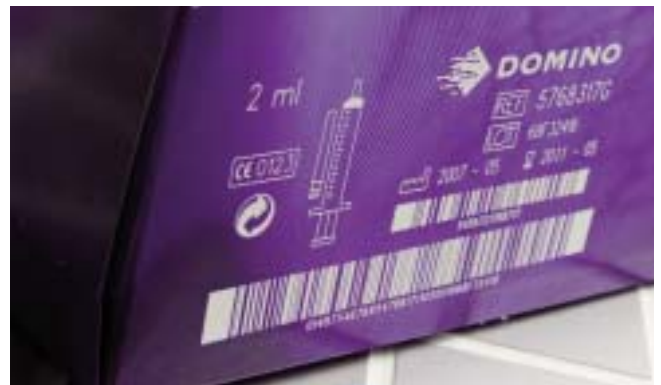
Example of Domino Laser Coding