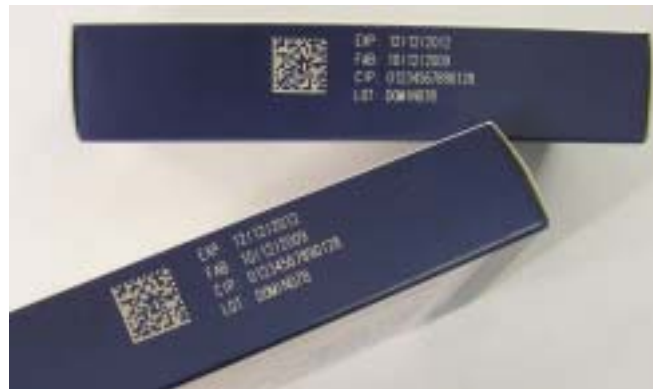
Example of Domino Laser Coding

"Domino coding solutions are a key prescription in the Healthcare industry"