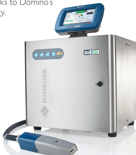
Ax350i – all the flexibility CIJ has to offer