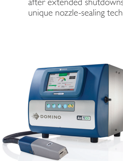
Ax150i – an ideal solution for all your basic coding needs