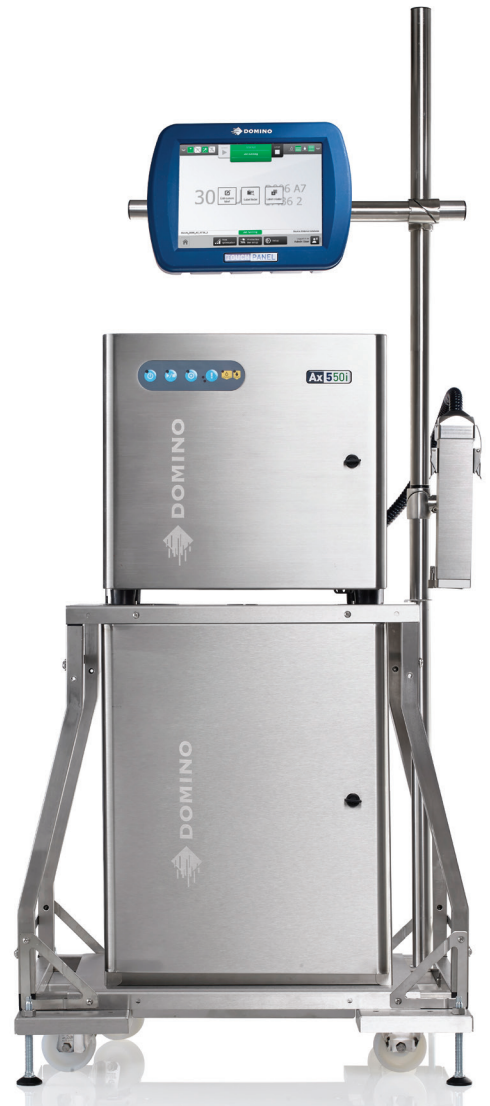
Ax550i – in harsh environments you can't beat the Ax550i