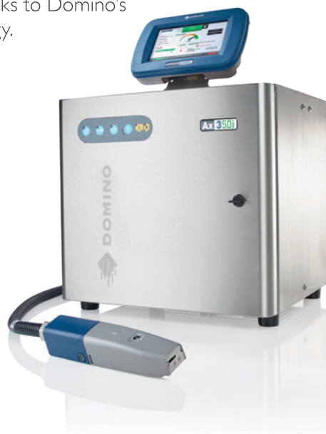
Ax350i – all the flexibility CIJ has to offer