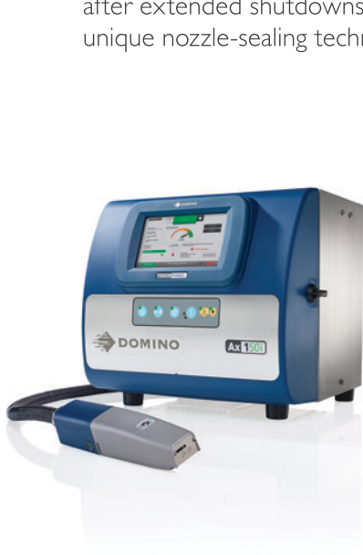
Ax150i – an ideal solution for all your basic coding needs