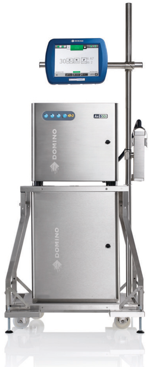
Ax550i – in harsh environments you can't beat the Ax550i